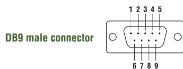
DB9 male connector